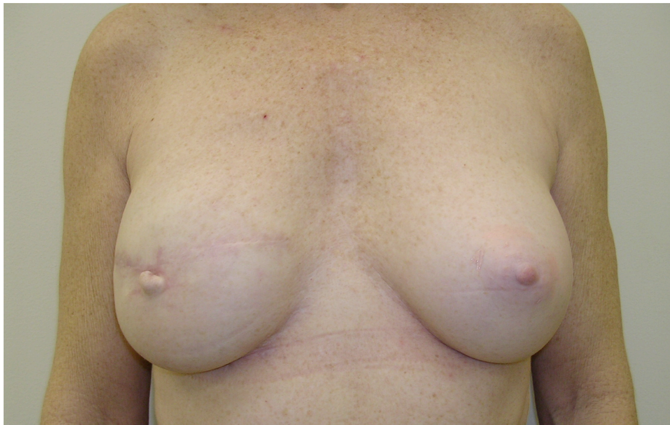
Figure 1. Two stage right breast reconstruction without use of ADM.

Conclusions: Excellent cosmetic results can be obtained in breast reconstruction with or without ADM as Figure 1 demonstrates. The algorithm demonstrates the specific situations when the uses of ADM are beneficial. This algorithm can contain costs when anatomy following mastectomy is favorable and ADM is not necessary.